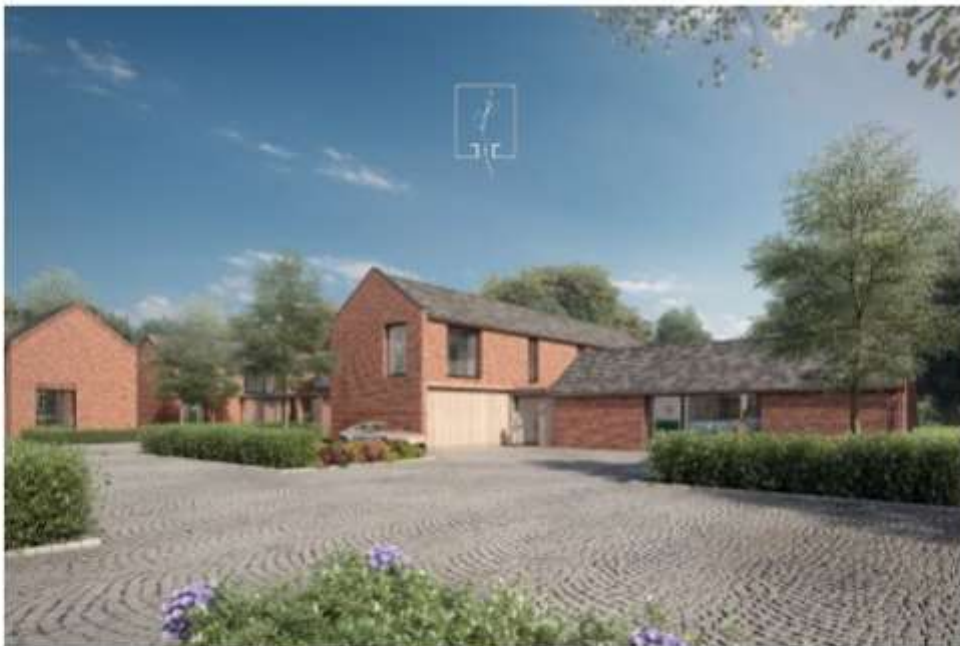
Front Facade & Driveway PLOT 04

VIEWING: By appointment only, arranged through this office